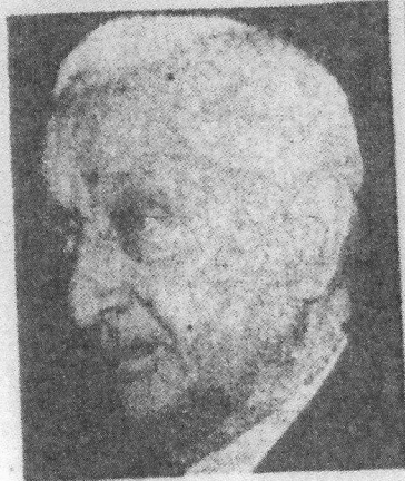
CYRUS EATON Among the duped!

suggestion. Hence the conference in his Canadian idyll, "Thinkers Retreat."